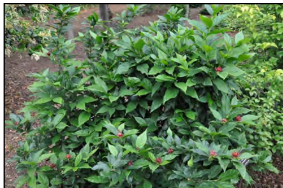
Variety - "Michael Lindsey"

This is a very tough shrub that is not fussy about soil conditions and while it likes moisture