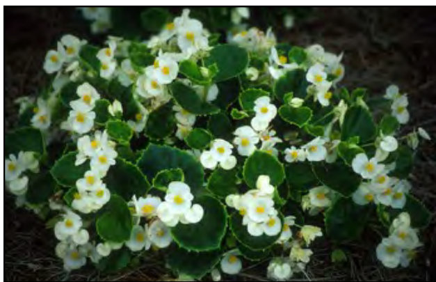
Wax Begonia Begonia semperflorens Variety - "Prelude White"