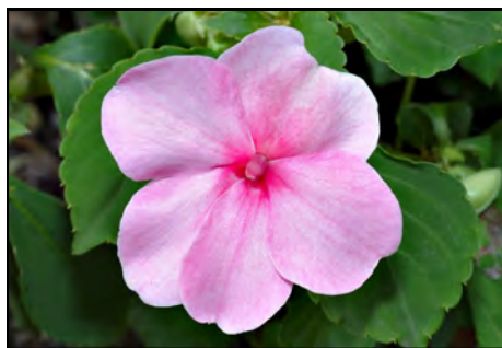
Impatiens - I. walleriana

There are impatiens available for most situations. There are mounding varieties that work well for small flowerbeds, borders, and containers. Trailing varieties will cascade in containers and window boxes. New Guinea impatiens are tall and can tolerate more sun but also have colorful leaves. In the past few years there has been an increase in the number of impatiens varieties and colors. It is presently the top shade bedding plant in North Carolina. The most popular type of impatiens is I. walleriana . They grow in mounds from about 6-24 inches in height. Some varieties have 1-2 inch flowers. There are some wonderful double blooming varieties. The trailing impatiens will spread over the bed up to 20 inches. Most impatiens will bloom with only a few hours of morning sun. The New Guinea impatiens have unique features, such as growing up to 2 feet tall, having larger flowers and variegated leaves. The New Guinea types need more sun to have heavy bloom in the garden. Both types of impatiens do like cool temperatures around 60-70 degrees F. and plenty of soil moisture. Impatiens do not like a hot sunny location. Of course the New Guinea type will tolerate more sun as long as they are kept moist. Make sure you wait till after danger of frost to plant, since all impatiens are frost-sensitive.