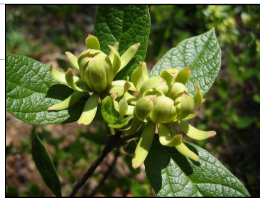
Variety - "Athens"

contrast with bright flowers. They will also tolerate full sun in some microclimates or cool summer areas. Begonias come in a wide variety of shapes and sizes. The wax begonia is the most common bedding type and they look their best when grouped together in beds or containers. The leaves can be bronze or green which gives us a nice focal area. Flower colors include white, pink, and red. Other types of begonias include angel wing begonias with broad foliage and tuberous begonias with their camellia looking flowers. Plant your begonias when the danger of frost has past. Most do best if the area for planting is amended with compost.