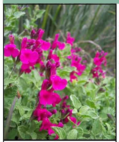
Salvia microphylla 'San Carlos Festival'

There are many annuals that contribute to late summer color in the garden. There are also many perennials that really stand out for their color bursts not only in late summer but many of these will bloom until the frosts of late October or November. Cannas and ornamental gingers are two that quickly come to mind. Cannas will bloom all summer long and into fall. Ornamental gingers will bloom from late summer into fall and, as an added bonus, most are quite fragrant. These two come in many different colors and shades to fit most any planting scheme. Salvias are another fantastic perennial that can fill the garden with late season bloom. Salvia greggii commonly known as Texas sage is a fantastic blooming machine that hummingbirds adore. It is truly a hummingbird magnet. The blooms of Texas sage come in many colors including all shades of red, yellow and white. There are also purple and pink varieties available. Texas sage grows between 2 and 3 foot high and equally as wide. It actually can be treated as a mini or subshrub, since over time it will become woody at the base. Trimming it back yearly in March will keep it more compact. Texas sage is very drought tolerant once established, since it is native to dry areas in Texas and Mexico. Salvia microphylla is a similar specie and like the specie greggii has many