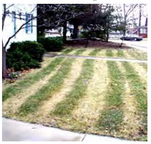
Misapplication of fertilizer using a drop spreader.

Step 4 – Always close the release handle on the spreader before filling and also fill only on a hard surface (sidewalk, driveway, etc). Spills are easier to clean and you won't damage the lawn with a burn. The pellets