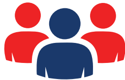
Multi-Partisan Assistance Team