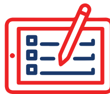
Disasable Styluses for Express Vote (Ballot Marking Device)