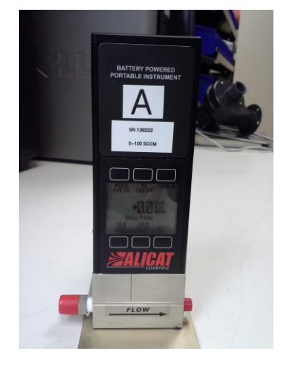
Figure 3: Alicat MBS Precision Gas Mass Flow Meter

Section 12 SOP for Calibrators June 2022 Page 14 of 24 Revision 2.1