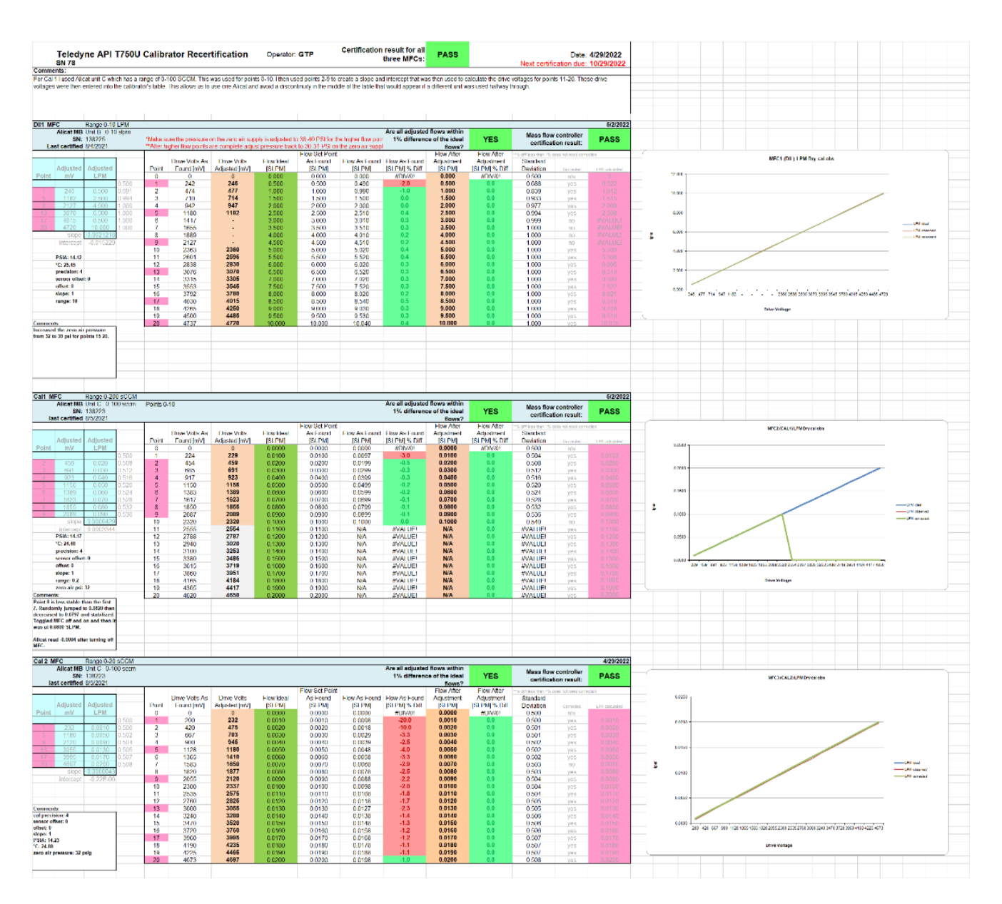
Figure 4: MFC Calibration Worksheet

Section 12 SOP for Calibrators June 2022 Page 15 of 24 Revision 2.1