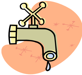
Repair leaking faucet