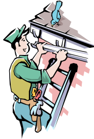
Clean leaf-clogged gutters