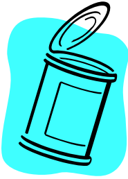
Throw away old bottles and cans