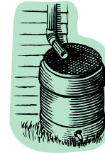
Screen or cover rain barrels