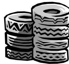
Throw away or destroy old tires