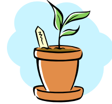
Empty water from flower pot dishes