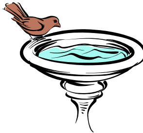
Change water in birdbaths weekly