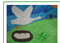
Poultry Poster by Laura Hutchins