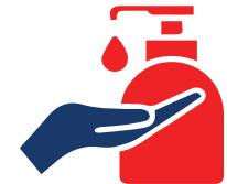
Increased cleanliness (sanitation of voting enclosure)