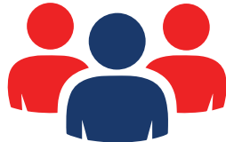
Multi-Partisan Assistance Team