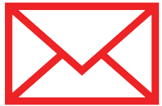
Absentee by-mail voting