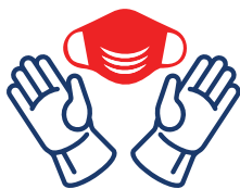
Poll Worker Health & Safety